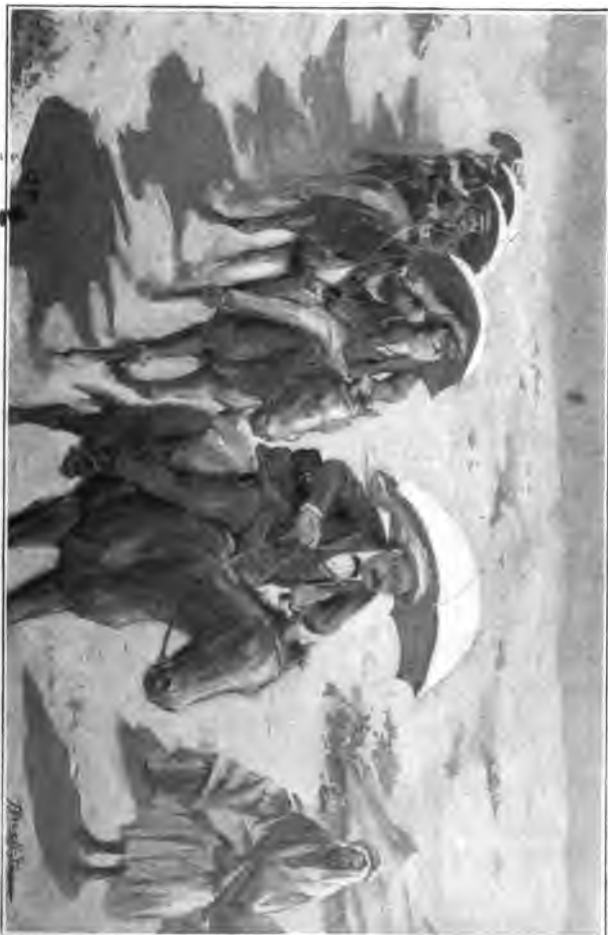
OUR PARTY OF EIGHT